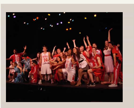
TEACHING WITH DRAMA AND MUSIC