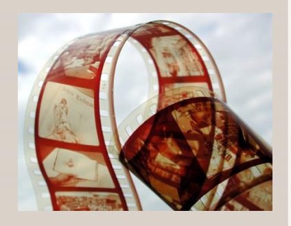
TEACHING WITH FILM AND VIDEO